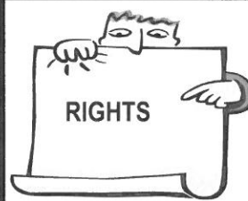
Keep your rights

IF YOU NEED HELP TO KEEP YOUR RIGHTS, CALL US!