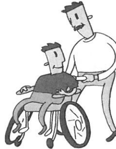
Be treated with respect and politeness