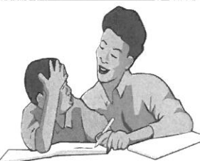
Complain if you don't get services or if you are hurt