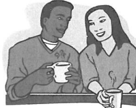
Have an advocate you trust who can help you speak up