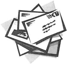
Send or receive personal mail