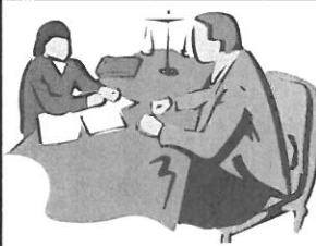
Participate in a plan to help you get better