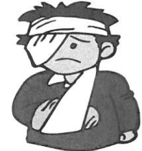
Not be abused or hurt