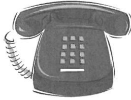
Make and receive phone calls