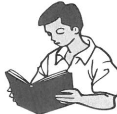
Read books and magazines