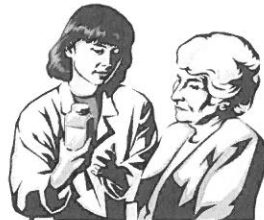
See a doctor