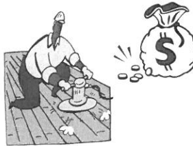
Fair pay for work you do